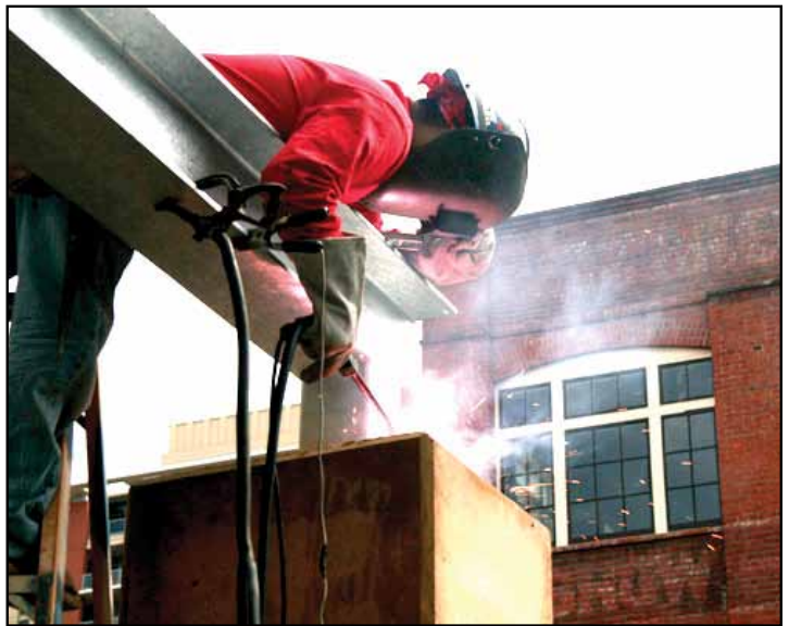
Welding certification renewals – a complete and correct submission will save you time and money!

Ironworkers Local Union 229 will hold nominations of Delegates to the International Convention held August 15-19, 2011, in Chicago. We will also hold nominations and elections of judges. In order to be eligible, you must have paid your monthly dues on time for the preceding two years. These will be held at the regular membership meeting on Friday April 8, 2011 at 7 p.m. at the union hall located at 5155 Mercury Point, San Diego. Election of Delegates will be held on Friday May 13, 2011 at 7 p.m.