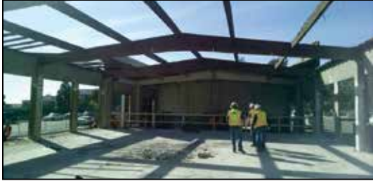
Work has started on the new training center.

Our new training center is now under construction. It is scheduled to open in September.